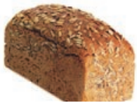
1 loaf of bread takes 150 gallons

How many gallons does it take to produce 1 medium apple?